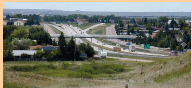
Gateways signify the transition point between rural and urban areas, and are often prominent locations within our community that can be visible for miles