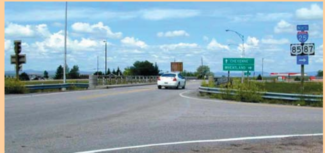
Community Gateways provide direct entrances into the Cheyenne. They are used daily by residents, and can also leave a lasting impression on Cheyenne’s visitors who use these Gateways to access services.

A Gateway is a distinctive and memorable place located at or near an entrance of the community or a District. It may be a distinctive arrangement of landscape, topography, signs, structures or other elements along a corridor that differentiates itself from its surroundings; and may include a Landmark.